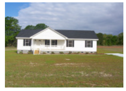
New house on Whippoorwill Road for CTH-II males. The name will be determined at the next DCDSNB Board of Directors meeting.

Look for the upcoming Ribbon Cutting, Name Dedication, and Open House Ceremonies!