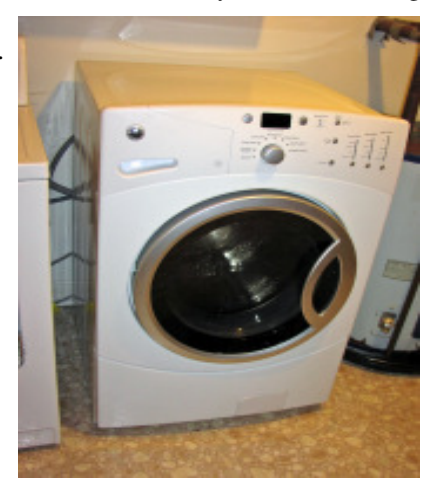
Bowen House's new commercial washer funded by the DCDSNB Foundation