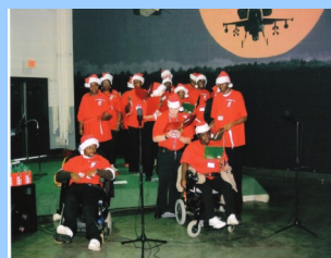
The BTG Choir They are awesome!

We are looking forward to spring and summer and revival of our BTG Garden, which was such a success in 2009. We will be planting tomatoes, squash, cucumbers and zucchini again this year. Our perennial flowers are already beginning to sprout growth!